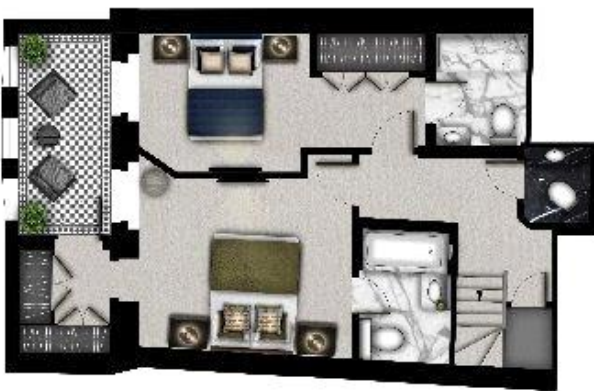
COURT YARD LEVEL