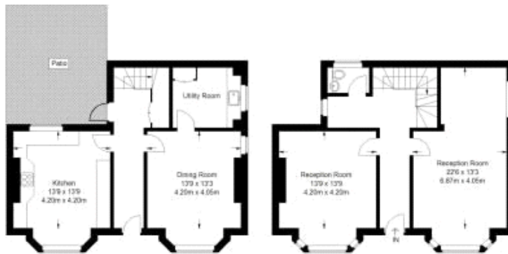
Lower Ground Floor = 587 sq ft / 52.8 sq m