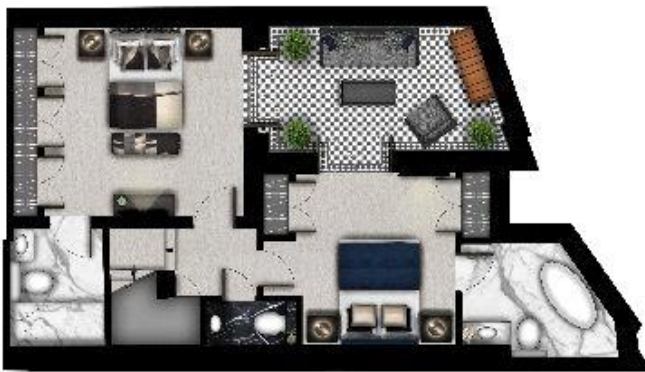
COURT YARD LEVEL