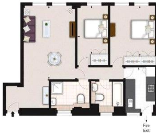
ILLUSTRATION FOR IDENTIFICATION PURPOSES ONLY. NOT TO SCALE *As Defined by RICS - Code of Measuring Practice

APPROX. GROSS INTERNAL AREA * 721 Ft 2 - 66.98 M 2