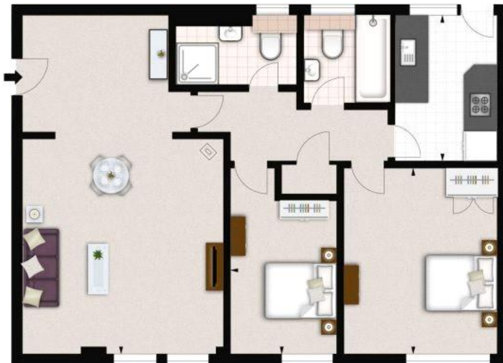
ILLUSTRATION FOR IDENTIFICATION PURPOSES ONLY. NOT TO SCALE * As Defined by RICS - Code of Measuring Practice

APPROX. GROSS INTERNAL AREA * 756 Ft 2 - 70.23 M 2