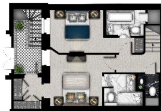
COURT YARD LEVEL