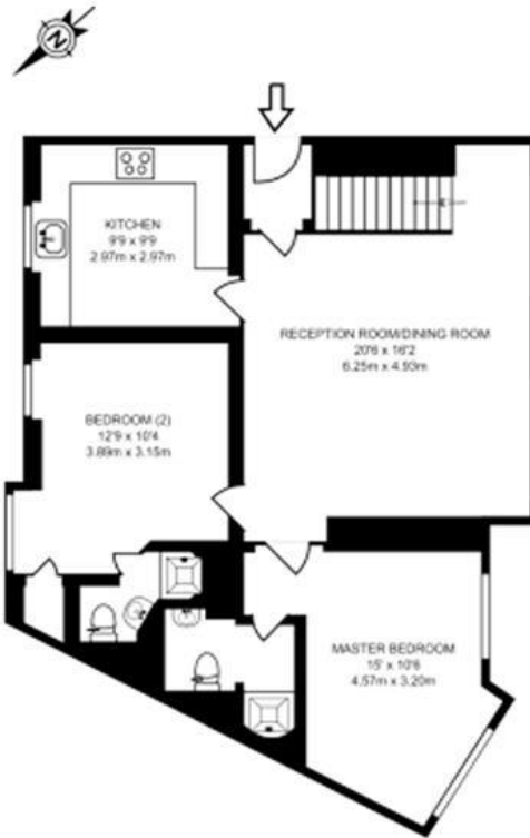
GROUND FLOOR 854 SQ FT/79.38 SQ M