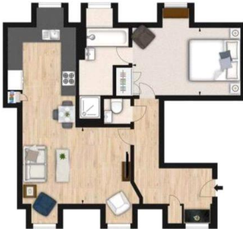
Illustration For Identification Purposes Only. Not to Scale * As Defined by RICS - Code of Measuring Practice